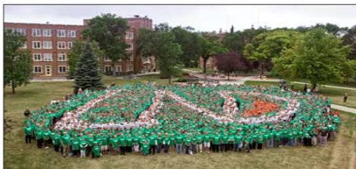
University of North Dakota 125 th Anniversary