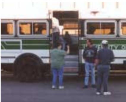
Climbing aboard the UND Bus.

Volunteers go to help clean up after a flood in Roseau, Minnesota!