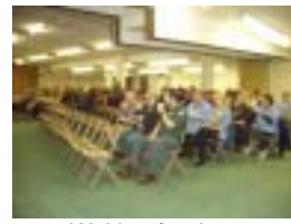
Waiting for the show to start!