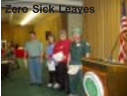
Zero Sick Leaves