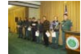
1/4 to 8 Hours Sick Leave Awards