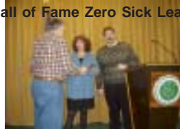
Hall of Fame Zero Sick Leave