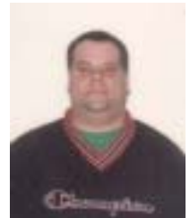
Lon Carlson Laundry Started 3/20/06